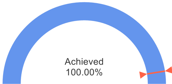
% Reporting Positive Experience (Target 95%)

The table shows the percentage of staff that reported a positive experience for each quarter. Where this figure is green, we have met our target and where it is red, it indicates that we did not achieve our target. The table also clearly shows whether the figures have increased, decreased, or remained the same when compared to the previous month.