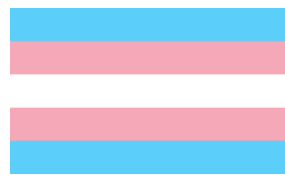
Transgender Pride Flag