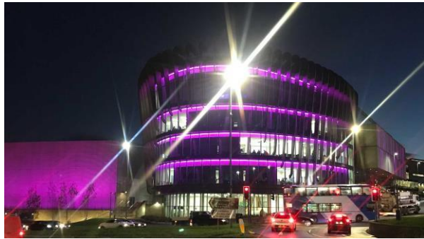
The Oastler Building lit purple to mark IDPWD