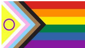
Progress Pride Flag