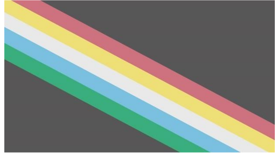
The Disability Pride Flag

Disability Pride Month is celebrated each July to recognise the achievements and identities of people with disabilities, promoting mainstream awareness of this positive pride movement. It also serves as an opportunity for people in the disabled community to promote their own self-acceptance and empowerment, as well as their individual successes.