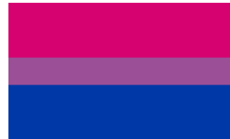
Bisexual Pride Flag

7 – Ganesh Chaturthi (Hindu) 22 – Autumn Equinox (Wicca/Pagan) 15 - 16 – Milad un-Nabi* (Islam)