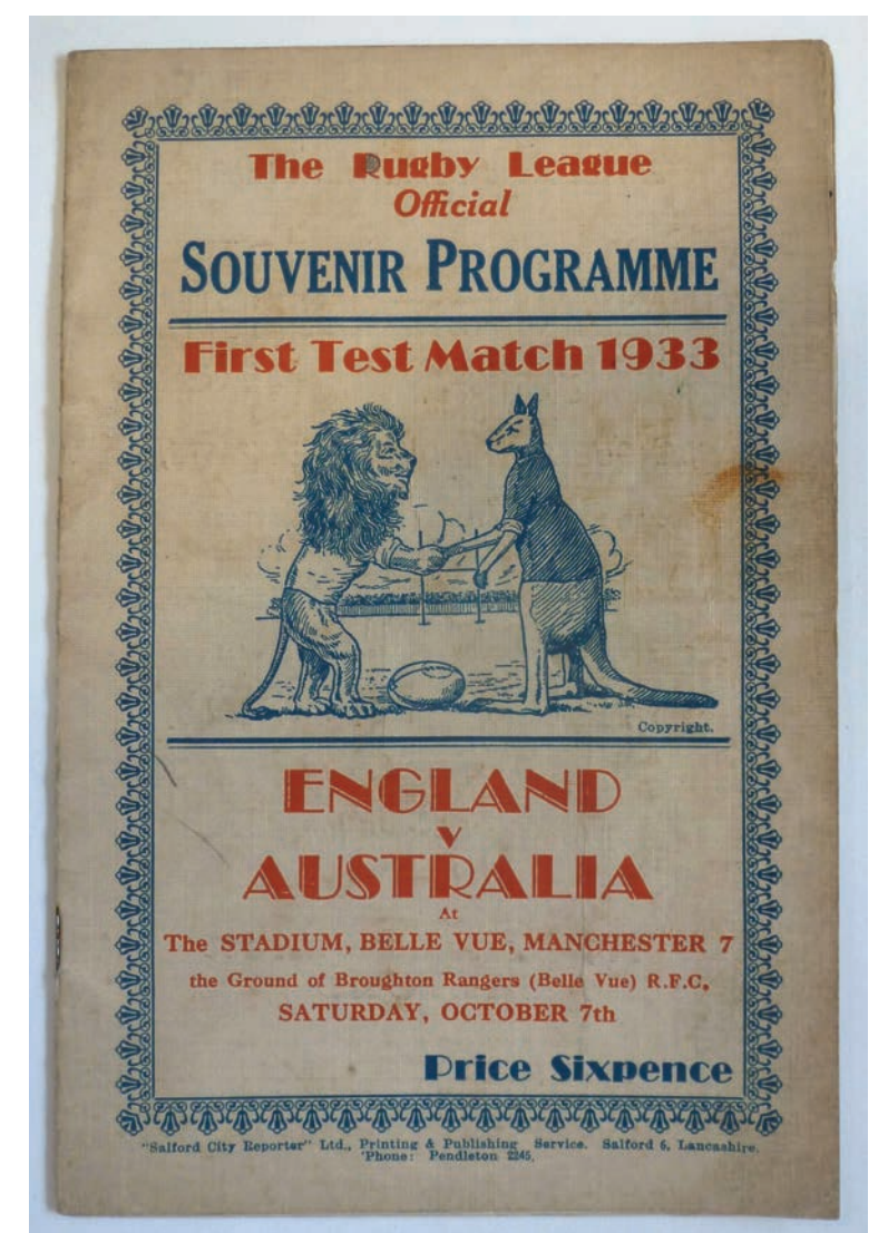
2. Programme for a match between England and Australia, 1933